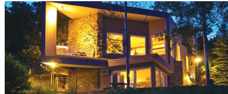
182 Anemone Drive

Expanded and extensively renovated home sits on a mature 5 acre parcel surrounded by Boulder County open space, with striking flatiron and back ranges views.