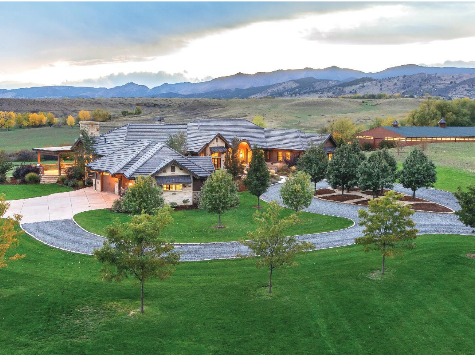
French Country Estate on 35 Acres Listed at $8,795,000

Overlooking 1,000+ acres of dedicated open space with the Flatirons as backdrop, this elegant custom-crafted home is reminiscent of a classic French-country estate.