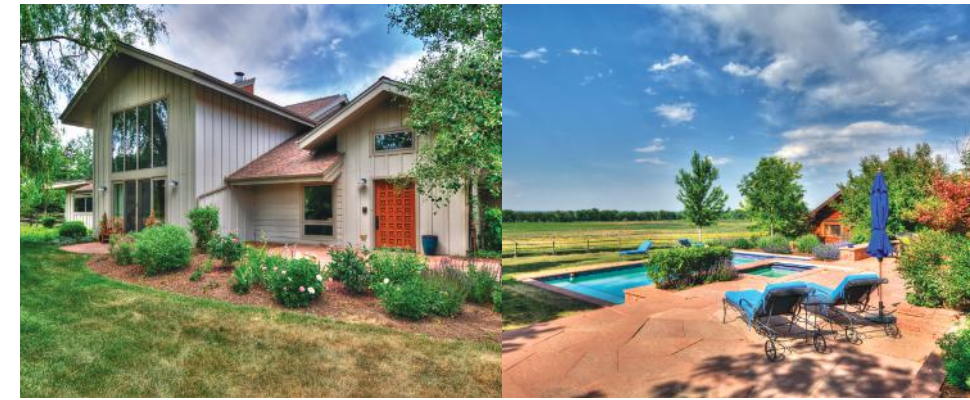
5 Acres Surrounded by Open Space

This ranch home on 35 acres offers an uncompromising equestrian lifestyle. Wonderful as-is or welcomes renovations to taste. Charming guest cottage is beside year-round flowing water. Complimented by a pool, spa and patio. World-class equestrian facilities with an Olympic sized dressage arena.