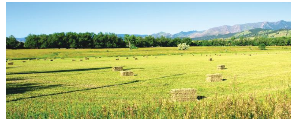
35 Acre Parcel

With its classic contemporary design, sun-filled windows and multiple outdoor living spaces, 182 Anemone is an inspired home that has been extensively renovated and extremely well-maintained. The lot and location could not be more ideal, perfectly set only 2.3 miles from downtown Boulder, on a private 1.7 acre site.